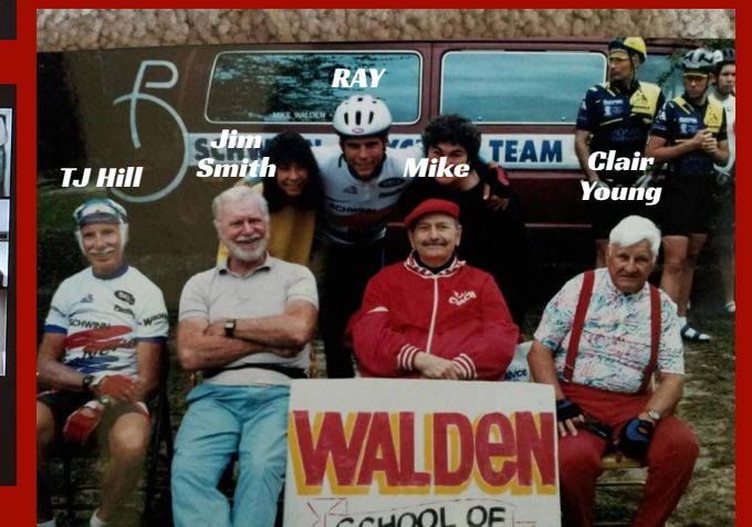
Circa 1980(s) Florida Walden School of Cycling